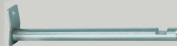
Bolt for padlock -one side- at the fixed support (optional)

Stability through stabilisation rope for 5,500mm boom length and larger