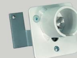
Fire emergency release at the barrier stand (optional)