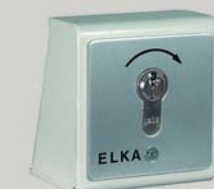
Cylinder lock at the fixed support (optional)