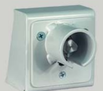
Fire emergency release at the fixed support (optional)