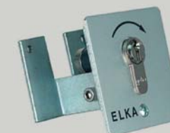
Cylinder lock at the barrier stand (optional)